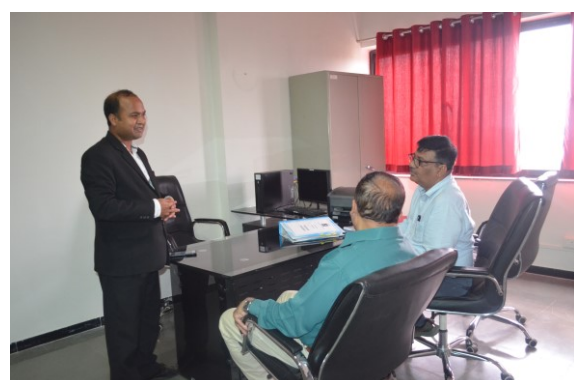
Visit to Training and Placement Dept.