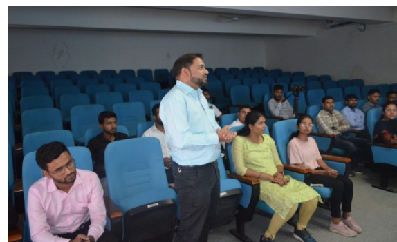
Interaction with the Alumni - Feedback