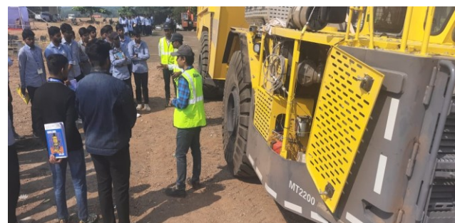
Epiroc providing hands-on practical knowledge