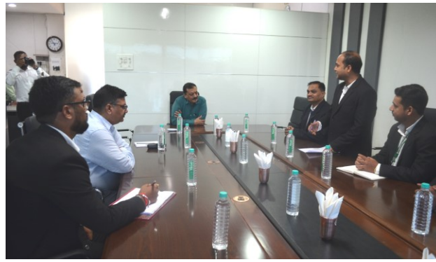
Interaction with the HOD's.