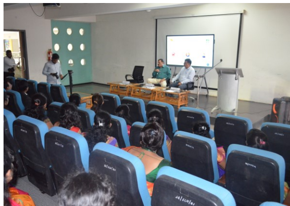
Interaction with the staff - Feedback