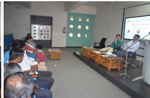
Interaction with the Parents - Feedback