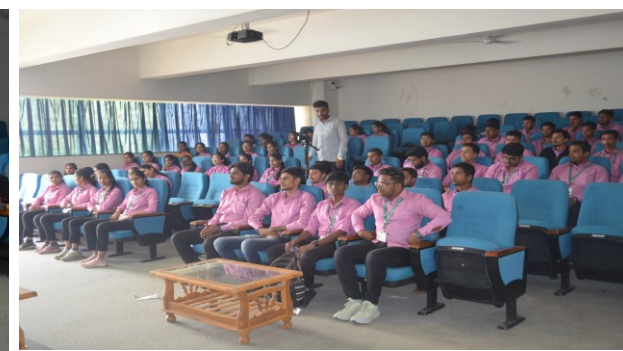
Interaction with the Students - Feedback