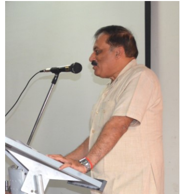
Words of Chairman (NAAC Team)